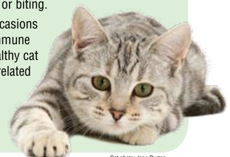
Cat photo: Jane Burton

The good news is that there is a very effective vaccine, giving cats protection against this deadly disease. Please contact us for further information or an appointment.